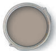
Interior walls WAYNESBORO TAUPE 1544 Benjamin Moore

The intent behind the home's design was to seamlessly marry the spectacular mountain setting with a haven that's equal parts comforting and contemporary. Through thoughtful choices and memorable design elements, the team accomplished this in an inspiring way. USD